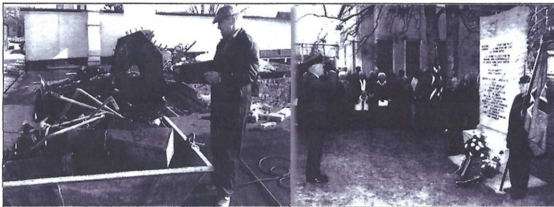
Above left: parts from the Halifax discovered and right: memorial service to the crew 1994

He thought back to the man's face he saw looking out of the airplane. It was night and very dark, so he wondered how he could have seen the face so clearly. However, there was light from various sources, the airplane itself, the German gunfire and from the moon which was also from the right direction, but most of all, the Halifax must have been very close.